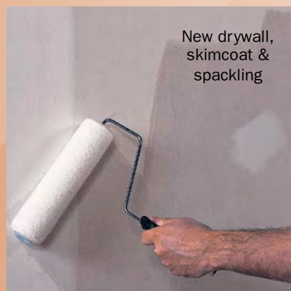
New drywall, skimcoat & spackling